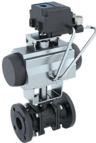
Ball valve model KHA with V – Port ball & pneumatic actuator